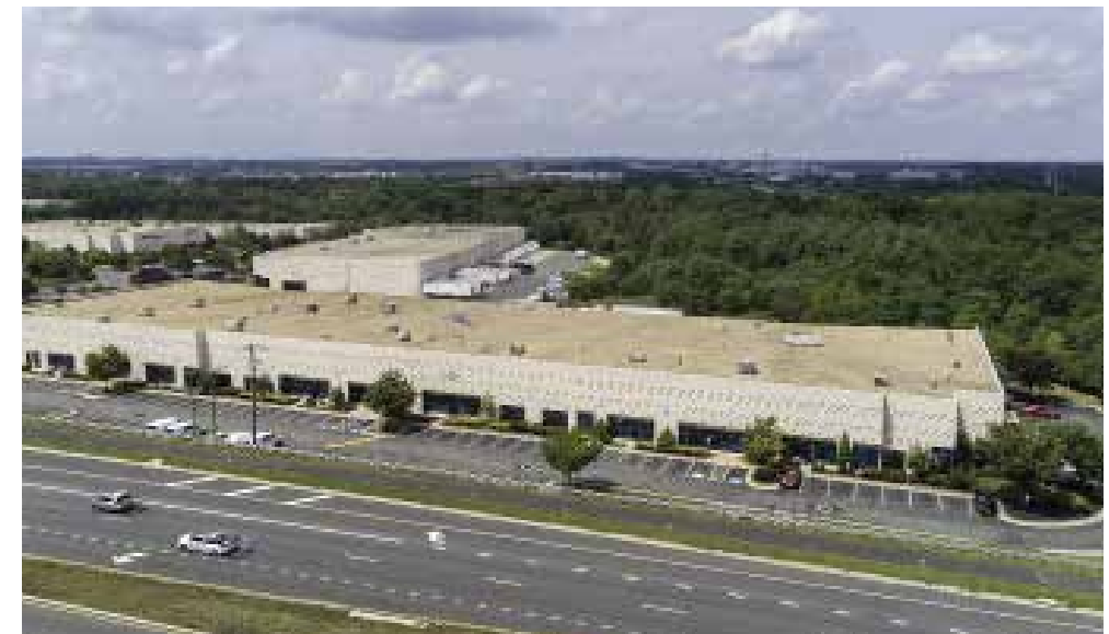
Magnolia's Headquarters Warehouse in Sterling, VA